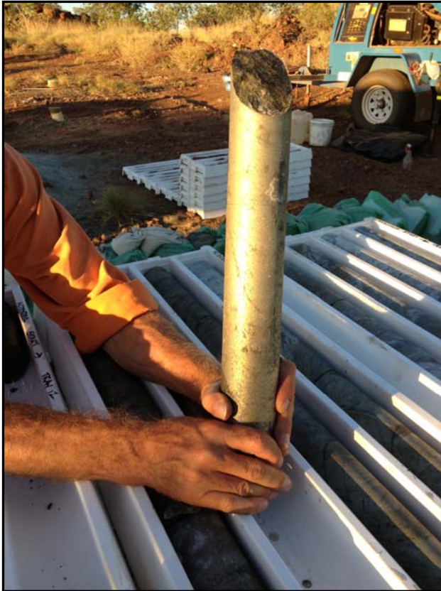
Massive chalcopyrite drill core, HCDD0001